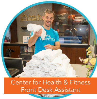
Center for Health & Fitness Front Desk Assistant